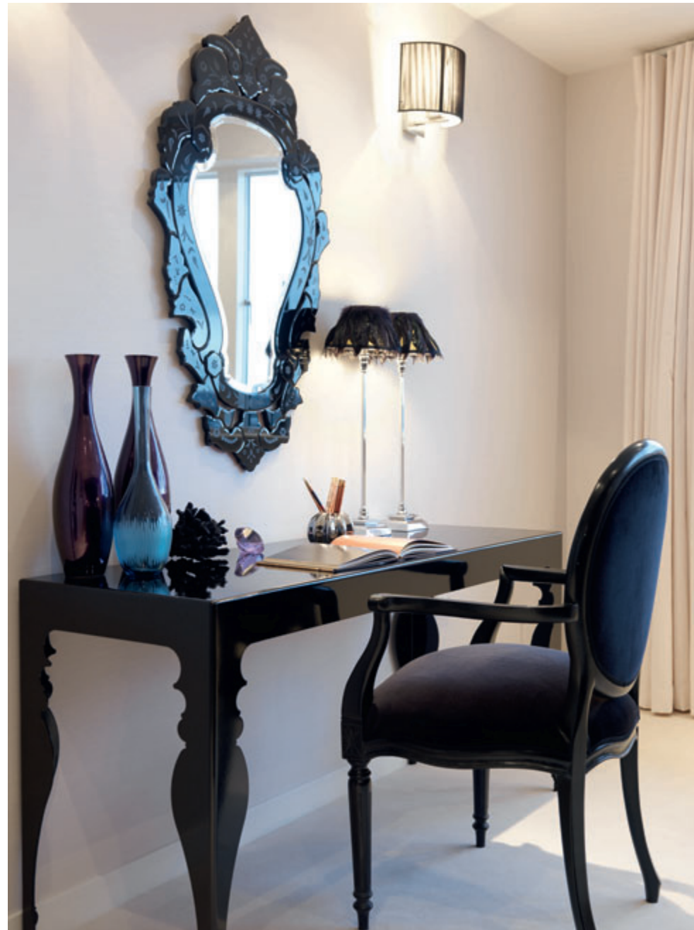
above Masculine yet glamorous, the dressing table is ideal for make-up application or penning letters.