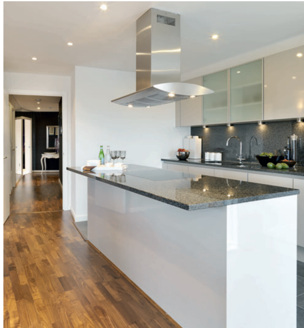
above & below Ideal for meal preparation, the island has a durable granite worktop plus a ledge at one side for bar stools. Opaque glass-fronted wall cabinets are framed in aluminium to add interest and variety to the handle-less design.